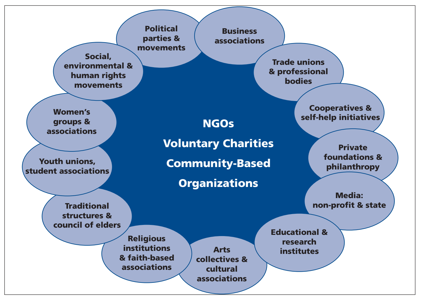
Figure 1: Civil Society - Diverse Sectoral & Organizational Forms