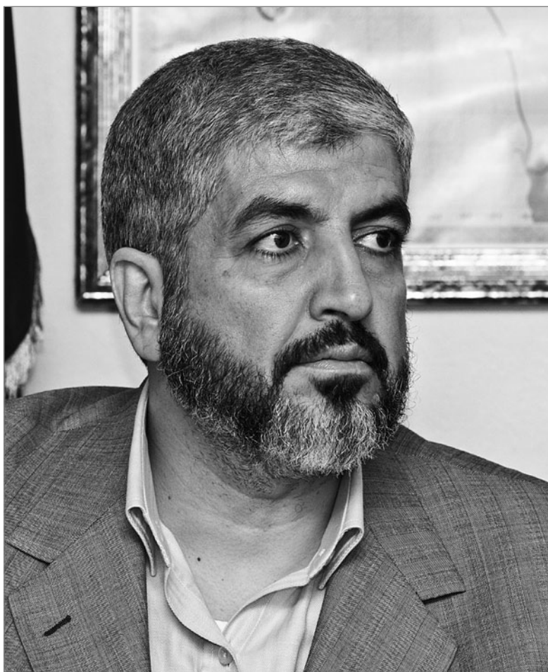
KHALED MESHAL, chair of Hamas Political Bureau