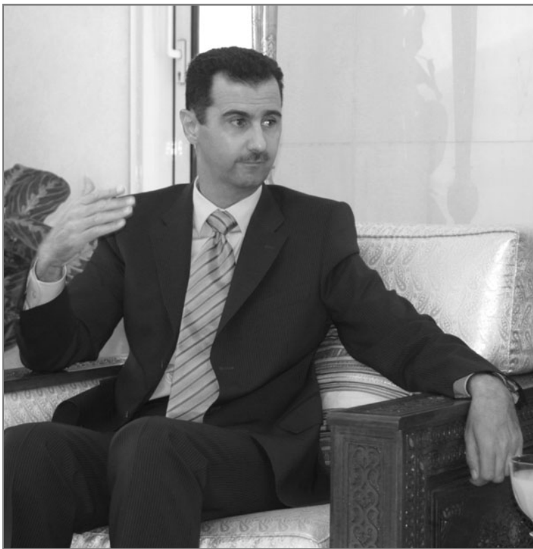
Syria's President BASHAR AL-ASSAD