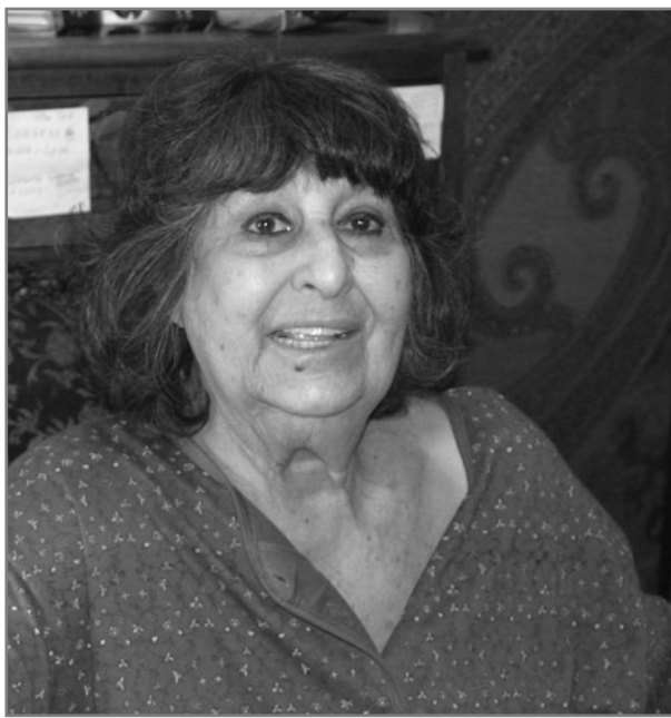
GEULA COHEN, member of Stern Gang and former member of the Israeli parliament