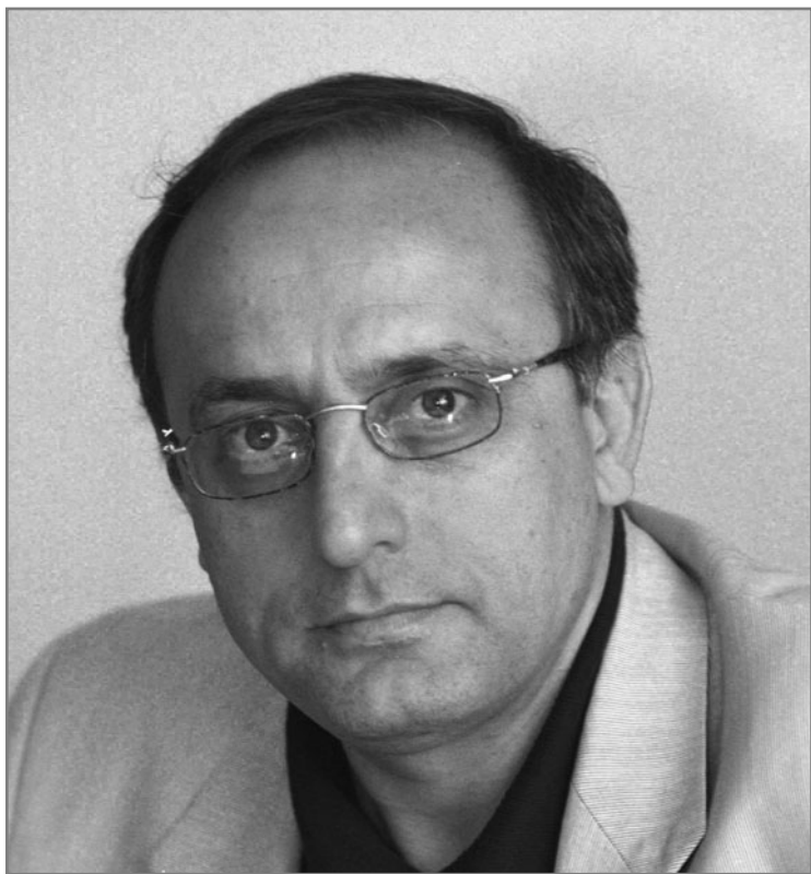
MOHSEN SAZEGARA, a founder of Iran's Revolutionary Guard and current activist against the government of Iran