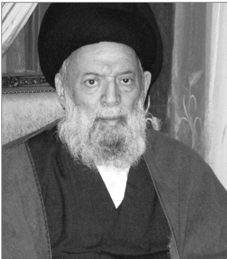
Grand Ayatollah MOHAMMAD FADLALLAH of Lebanon